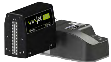
VIAjet™ T-Series T100 Print Head

Pittsburgh, PA | P 1.800.775.7775 | F 412.665.2550