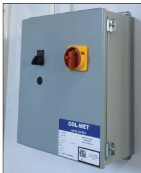
OPTIONAL CONTROL PANEL

Bright, full booth illumination is provided by 48" four-tube, 32-watt clear, fluorescent light fixtures in the ceiling panels. Each is sealed behind clear, tempered safety glass. All fixtures are UL listed and approved for their intended use and placement.