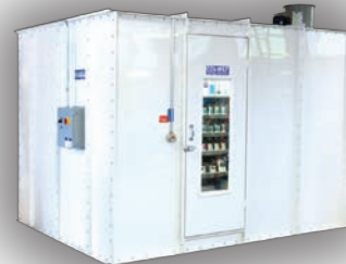
OPTIONAL POWDER COATED WHITE