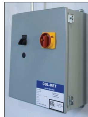
OPTIONAL CONTROL PANEL